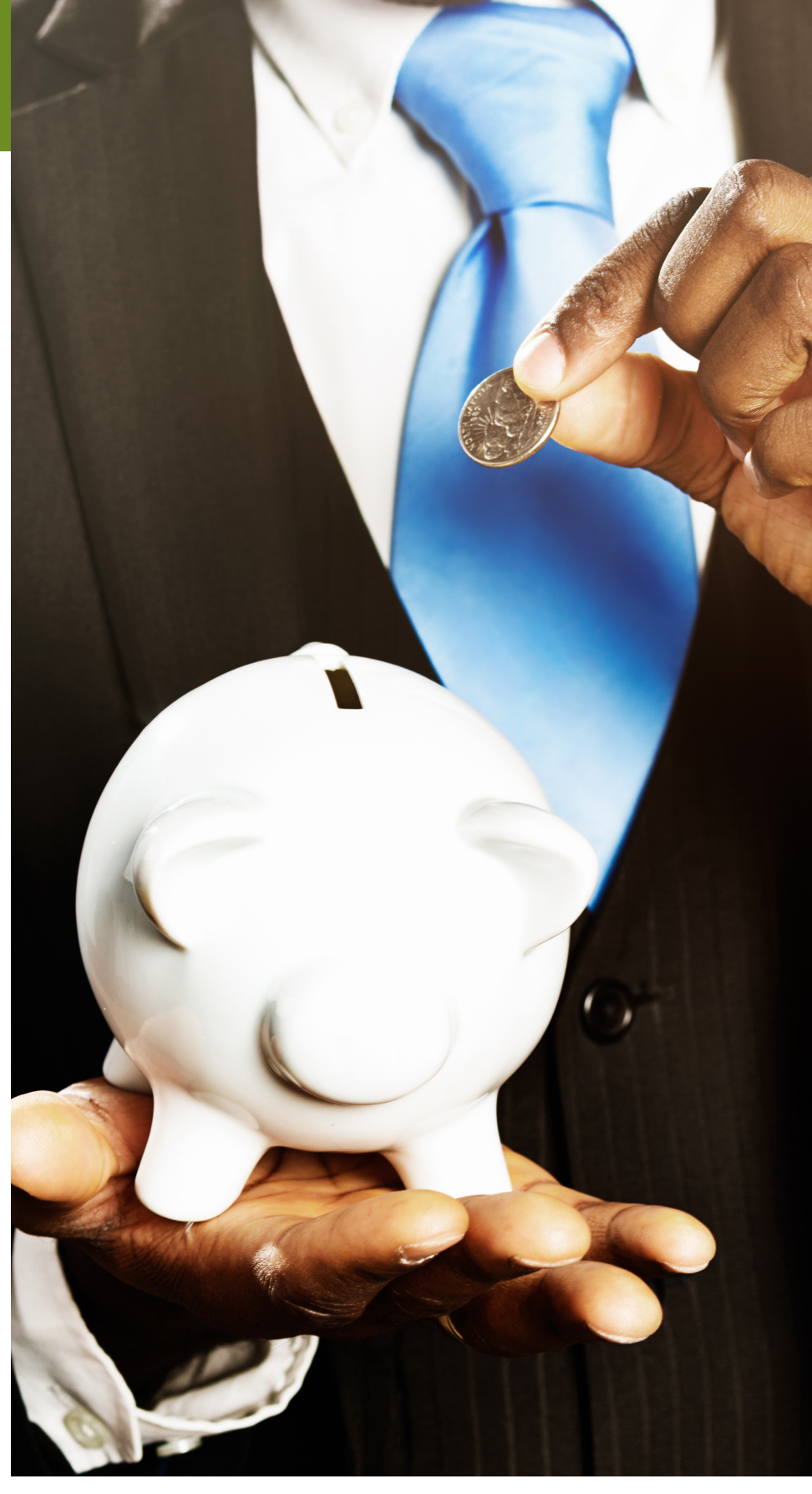
With a RF BrokerageAccount, you won't be spending a lot on commissions, margin interest and account fees. So you'll have more money to put to work for you.

For a small fee, payable annually in advance, RF will provide safe custody services and interest on your securities provide free online access to your account statements and provide daily market updates.